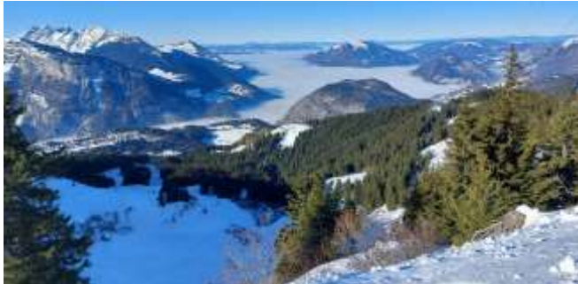
Fog in the valleys stayed stuck for days

I love approaching the Alps by road, as fields, woodland and hamlets gradually give way to bigger and bigger mountains until they loom above us on all sides. The excitement rises too! Eventually, we left the main autoroute and began the long corkscrew twisting climb upwards. Snow blanketed trees in the most picture-perfect way. It was beautiful, and one can only admire how well the French are able to keep the roads open and largely ice free, something our councils in the UK can only aspire to, as the recent problems on Dartmoor roads testify. My, how I love it in the snow-covered mountains! It's not just the skiing that attracts me, it's also the cold fresh air and spectacular locations. You just jump on a chair lift and within minutes arrive in the most incredible, awe-inspiring places. Descending is sometimes less easy as you'll read!