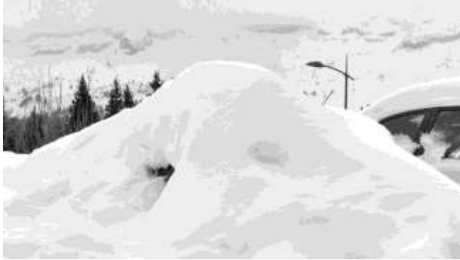
There are cars under here somewhere!