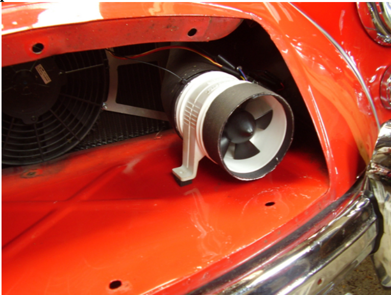
Lindsay Sampford's "bilge blower fan" (UK)

The rather basic low tech, non-cross-flow (but surprisingly effective) B-series head has, by virtue of its layout the hottest part of the engine, the exhaust manifold, running directly below the carburettors. As a result there is an unavoidable tendency for radiant heat to directly heat the incoming fuel in the bowls. With the additional issue of high under-bonnet temperatures, cramped airspace and poor airflow in hot idling conditions, the fuel can tend to vaporise in the fuel bowls. This problem can be further exacerbated nowadays by the requirement in many countries that at least 10% of fuel be ethanol based. For this reason it is imperative that the heat shield be fitted, and lined with insulating material. Many have experimented with different insulating materials, dual parallel heat shields, and even, fitted a fan, (such as a 4" diameter marine application bilge blower fan) into the carburettor cool air duct, to turn on manually, in provocative conditions.